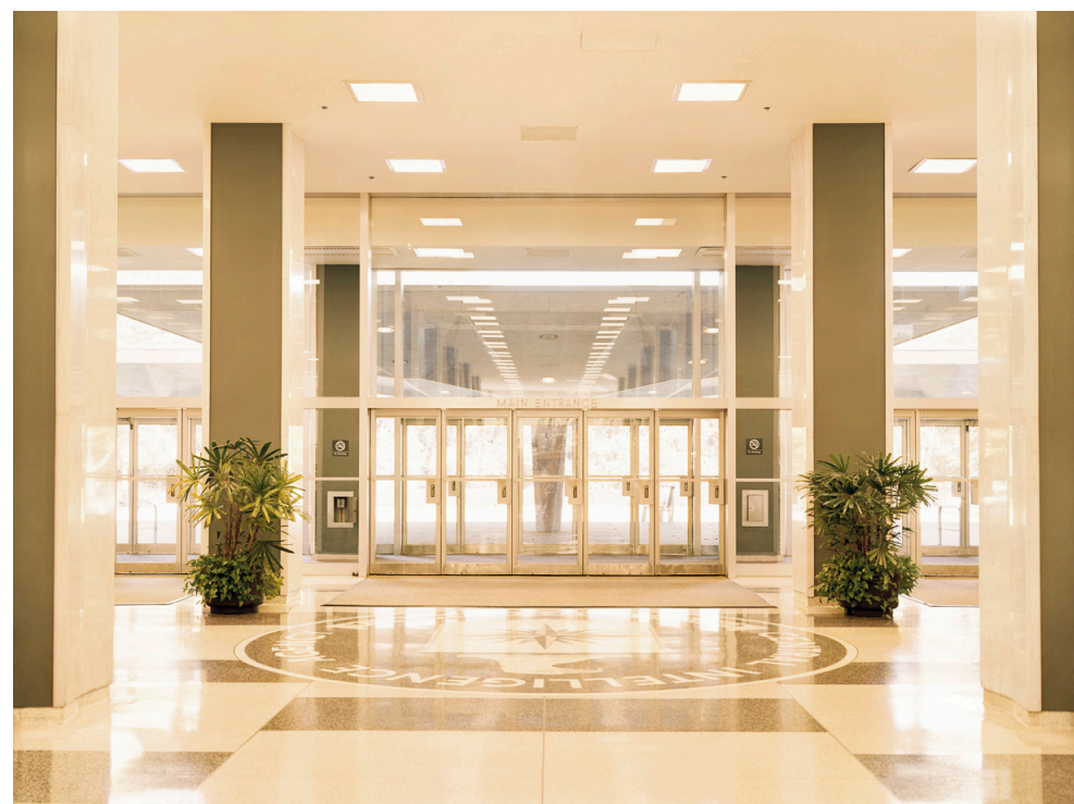
The Central Intelligence Agency Main Entrance Hall CIA Original Headquarters Building Langley, Virginia

Inlaid in the floor of the main lobby of the Original Headquarters Building is the emblem which has been the Agency's since February 17, 1950. It is comprised of three representative parts: the American eagle, "representing strength and alertness", the shield, "the standard symbol for defense" and the 16-point compass star, "representing the convergence of world intelligence data at a central point".