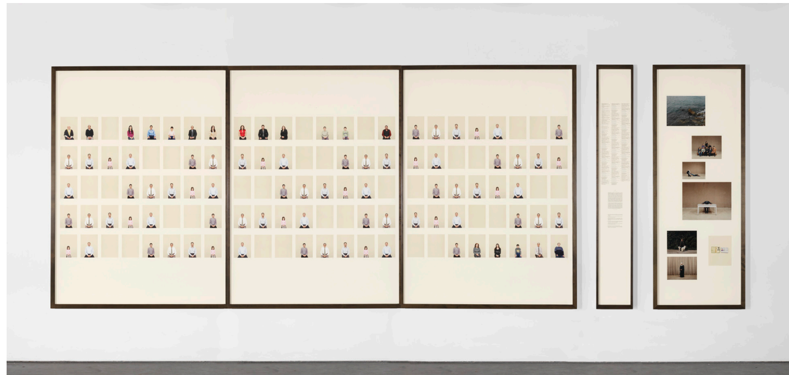
Installation view. A Living Man Declared Dead and Other Chapters , Chapter XIV, 2011 84 x 241 7/8 inches (213.4 x 614.4 cm)

the desire that extends beyond the testimony of photography, which is a desire for alterity , not simply continuity or closure.