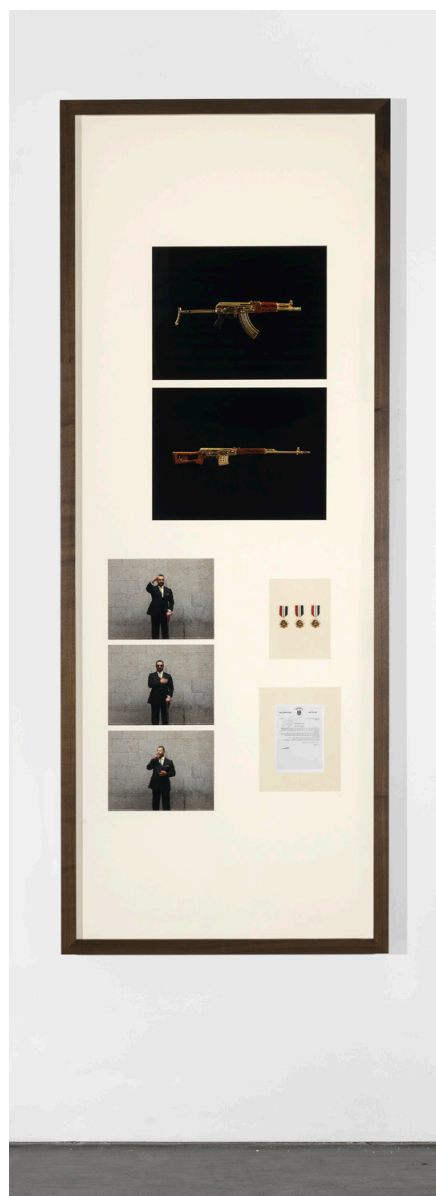
Footnote panel. A Living Man Declared Dead and Other Chapters , Chapter IV, 2011 84 x 31 1/2 inches (213.4 x 80.8 cm)

are believed to bring good luck and good health. It could be argued that Simon's interest lies in the banality of evil, but even that is a simplification. Each chapter may seem arbitrary and incidental and yet it leaves you with an unmistakable sense that this is a work about the fragility of human fate, and happenstance; but it is also a work that has been fortunate in finding the hidden signs that slowly bring to life the image of an age.