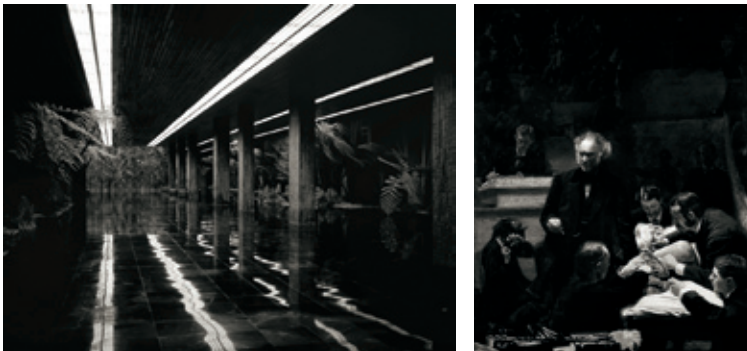
Taryn Simon, Interior of The Palace of the Revolution, Havana, Cuba , 2002; Thomas Eakins, The Gross Clinic , 1875

In Simon's photography, the American soil is wrapped up in a political, cultural, and economic quagmire, yet it never fails to offer unexpected splendors. As her photograph of a fireworks display informs us, this is where the largest American firework